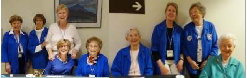
Some of the Auxiliary Members that worked hard to put on this event for the kids