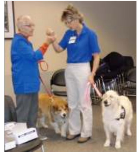
Our Pet Therapy Partners got into the act to relieve anxieties