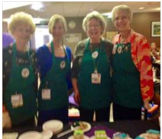
Cutting the Cake at Employee Appreciation Day

The group is always looking for more folks to join them. They meet at 10:00 a.m. on Monday mornings in the Volunteer Conference Room. You don't have to sew, knit or crochet to join in. There are other duties that can be done or if you wish to just join in and work on your own project(s) but have company while doing that, come and visit with this group and see if you would like to make this one of your weekly activities.