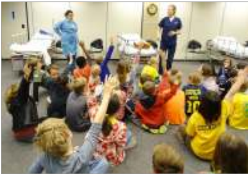
Presenters got the kids involved with questions and simulating becoming a patient in a hospital