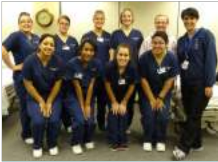
Nursing Students that helped with the Children's Health Education Days