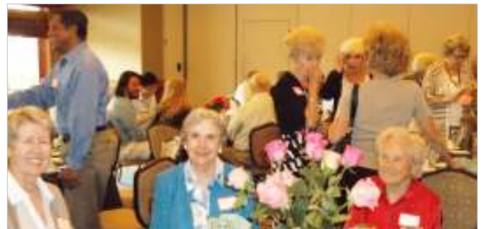
Photos from the Volunteer Appreciation Luncheon Some of Swedish Medical Center's Amazing Volunteers including the Pet Partners