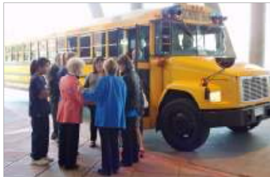
The kids arrived in bus loads and were greeted by the Volunteers